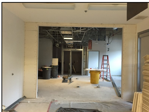
Looking into the new expansion area.

Due to the construction work, which is already happening, the STEM Center will not be open during Spring 2016. However, we will continue to offer tutoring, counseling, workshops, the STEM newsletter, and weekly updates for our STEM Scholars. We will also maintain the campus community up to date with important STEM Center information. We appreciate all your patience and understanding as we make the STEM Center bigger and better.