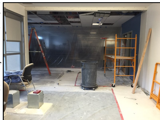
Looking at the STEM Center from the SI Classroom.

The anticipation is over; the STEM Center is now being remodeled! At the moment, the STEM Center looks very different than when we last left it in December. The tables and chairs have been moved out, and Mr. Bones along with the other anatomy models have been securely housed in other locations. The counseling office has been removed and a couple of other walls have come down as well. As for the staff, we are keeping out of the way of all this amazing transformation.