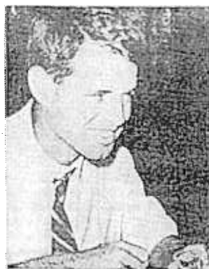
ROBERT KENNEDY ... Debates Saturday

Students and faculty members of the college are also hopeful that Mark Hatfield, Senator from Ore-